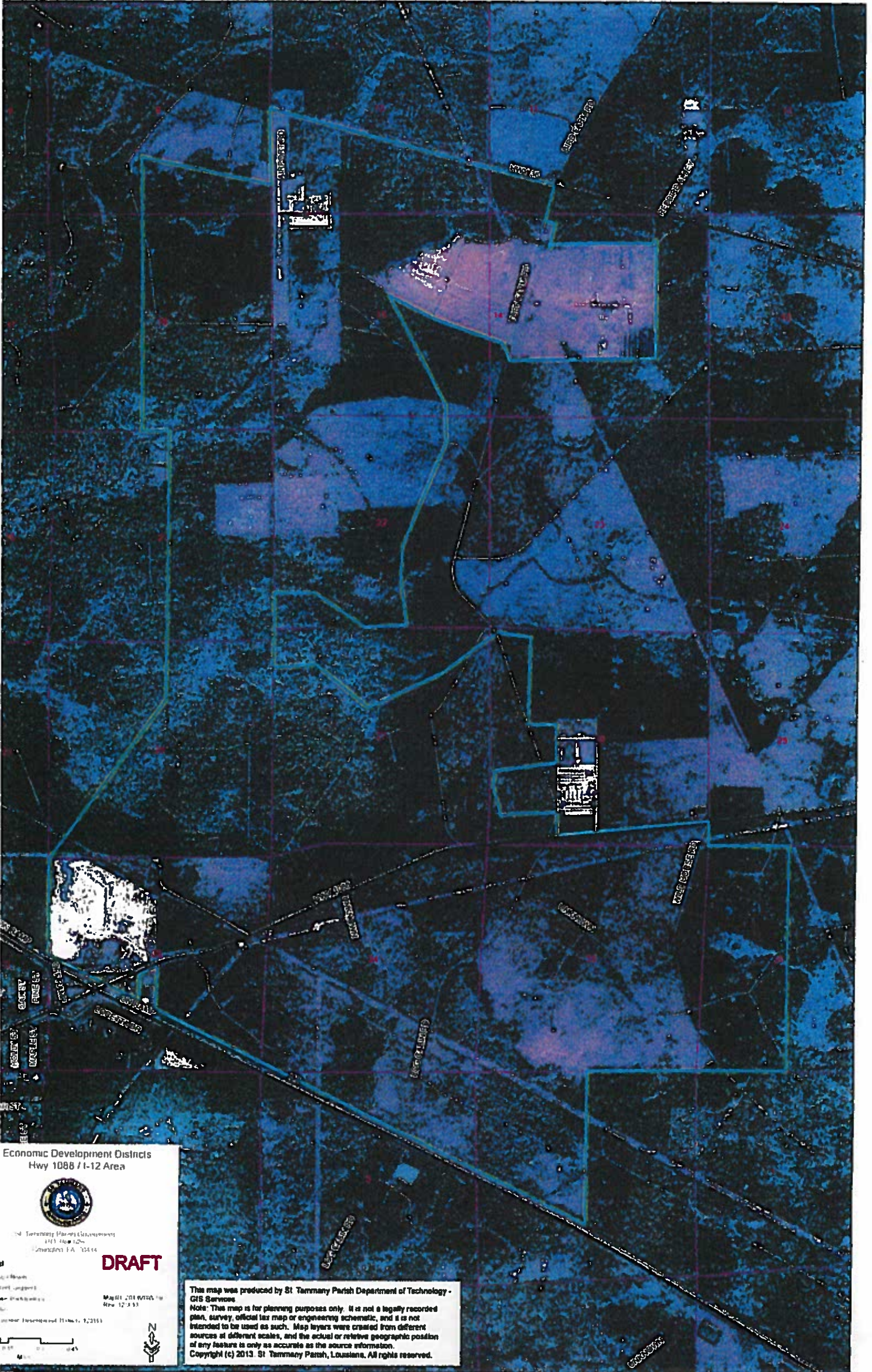
EXHIBIT "B" CONTINUED

Economic Development Districts Hwy 1088 / I-12 Area