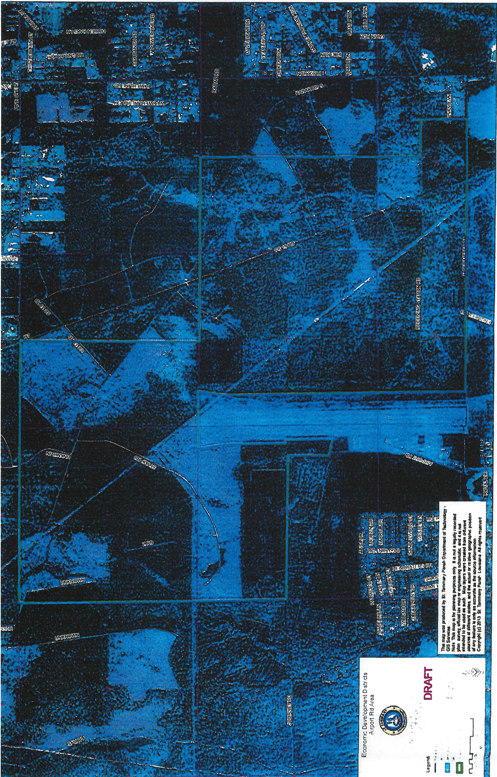
EXHIBIT "B" CONTINUED

Economic Development Districts Airport Rd Area