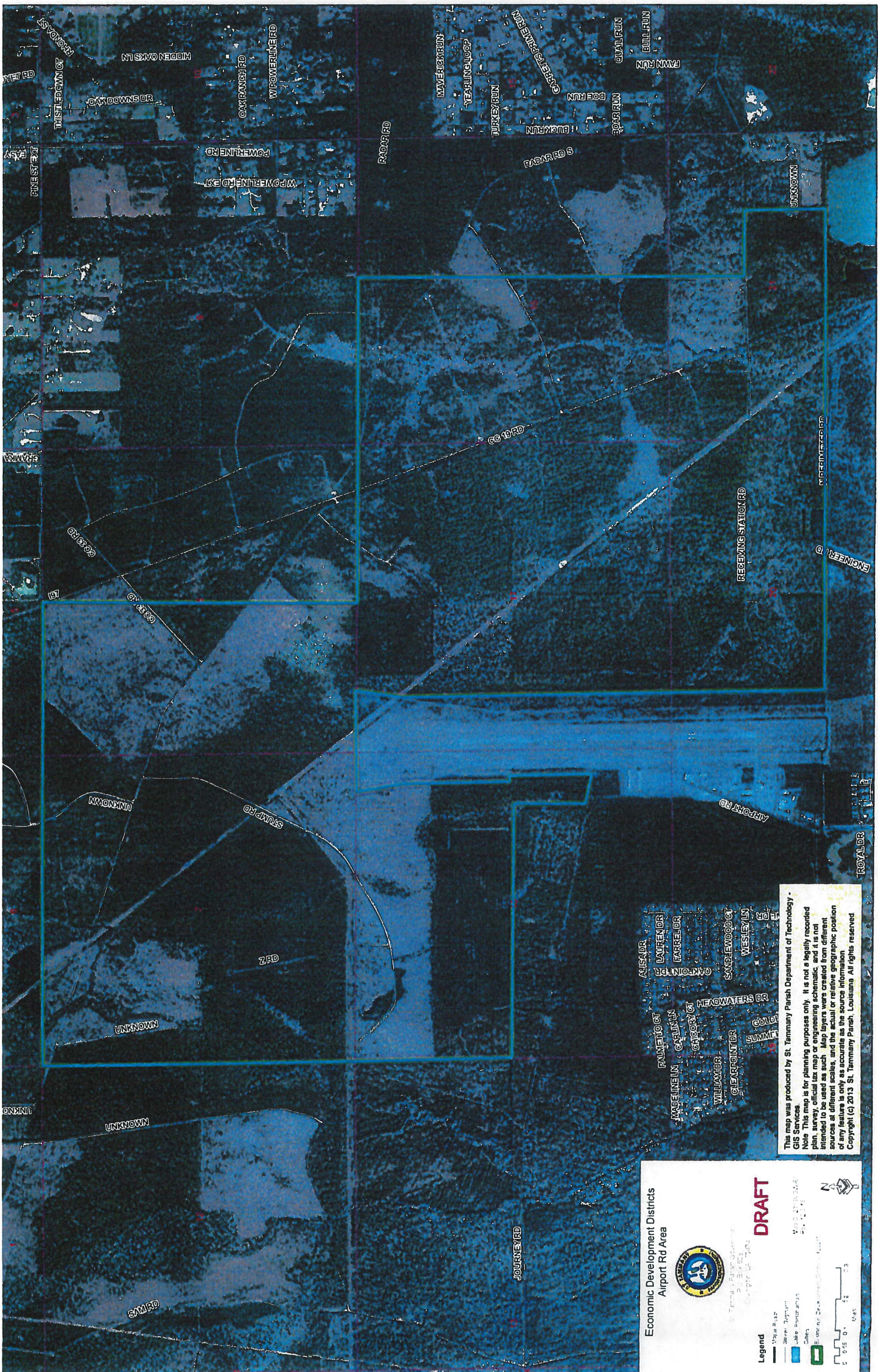
EXHIBIT "A" CONTINUED