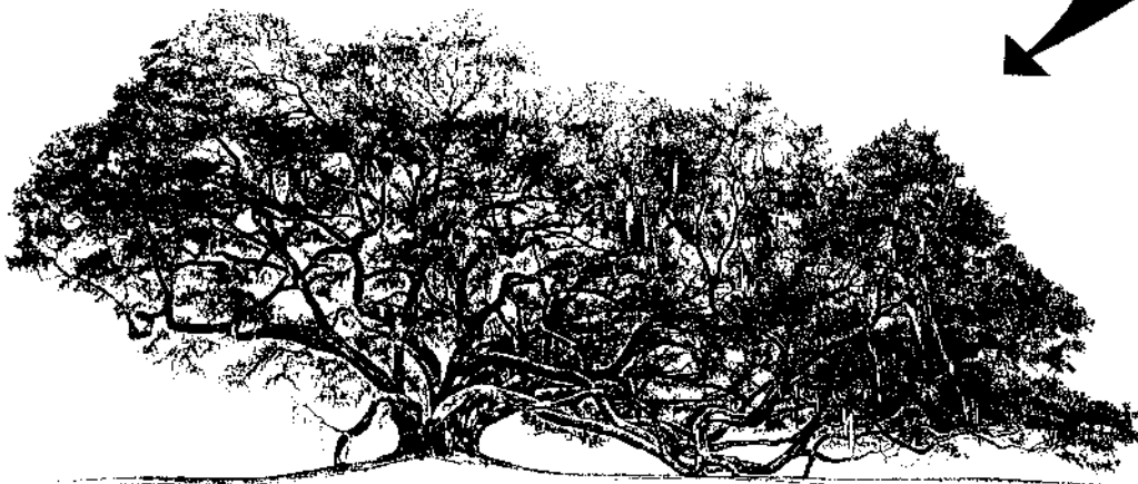
Seven Sisters Oak Tree - Lewisburg

© STEPHEN MALKOFF - To order this print go to: www.arboretum.com