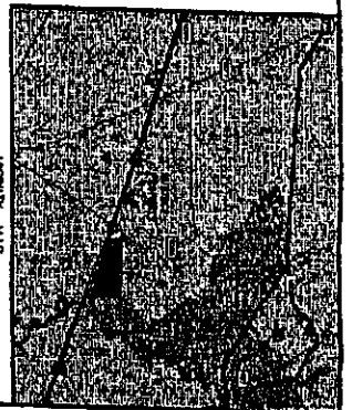
AERIAL PHOTO DATE: 11/15/83