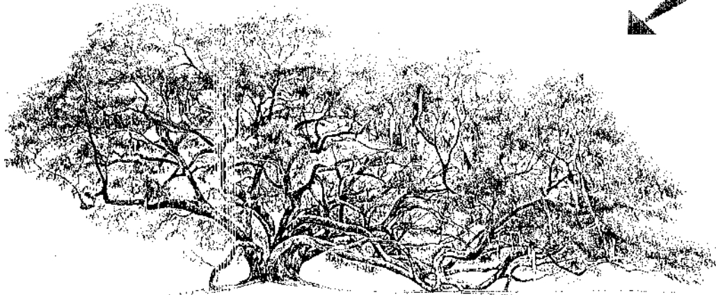
Seven Sisters Oak Tree - Lewisburg

© STEPHEN MALCOFF - In order this post go to: www.artsandque.com