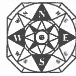
EXHIBIT "A" SKETCH ( Not to Scale )