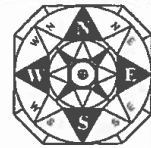
EXHIBIT "A" SKETCH ( Not to Scale )