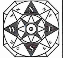
EXHIBIT "A" SKETCH ( Not to Scale )