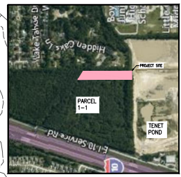
SITE VICINITY MAP NITD