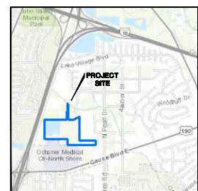
SITE VICINITY MAP N178

LEGEND - EXISTING EXISTING OVERHEAD POWER LINE ELEVATION OF TOP OF STRUCTURE ELEVATION OF BOTTOM OF STRUCTURE EXISTING SPOT ELEVATION ELEVATION OF TOP OF CURB ELEVATION OF FACE OF CURB